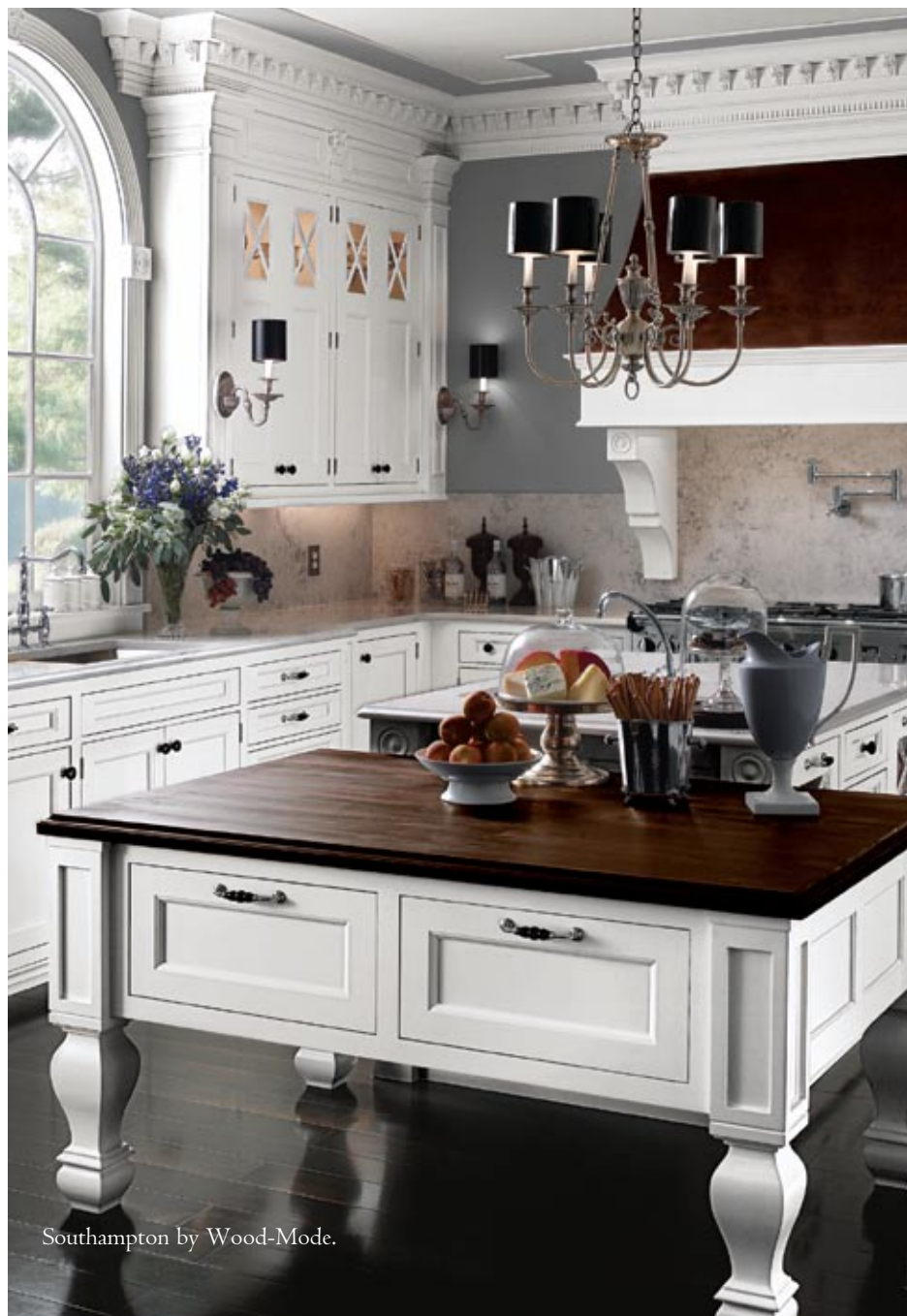
Southampton by Wood-Mode.