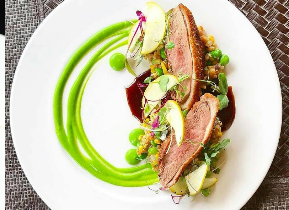
Doesn't have to be centered, try moving everything to one side of the plate