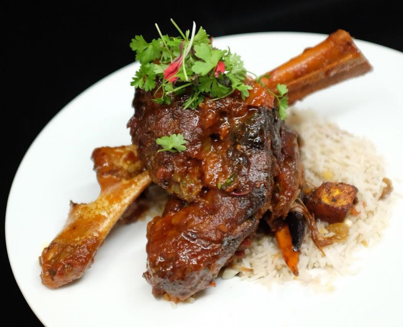
Food is piled high, pinch of micro greens on top